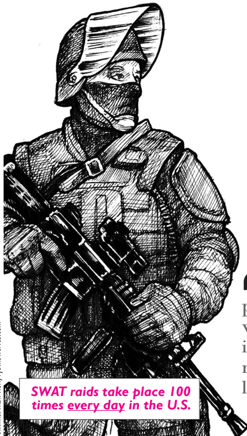
DRAWING: Matt Heff, tyothewolves.com

The attacks on 9/11 led to the U.S. government's endless "War on Terror" abroad. The creation in 2003 of the Dept. of Homeland Security (DHS) — a second "defense" department — brought that war home. While military style policing, especially in communities of color, grew with the war on drugs in the 1980s, access to the weapons of war has proliferated through Pentagon and now DHS programs. "Current military" on the pie chart incorporates the variety of federal agencies that contribute to the militarization of our lives.