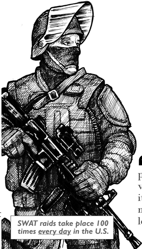
DRAWING: Matt Heff, jytheloves.com

The attacks on 9/11 led to the U.S. government's endless "War on Terror" abroad. The creation in 2003 of the Dept. of Homeland Security (DHS) — a second "defense" department — brought that war home. While military style policing, especially in communities of color, grew with the war on drugs in the 1980s, access to the weapons of war has proliferated through Pentagon and now DHS programs. "Current military" on the pie chart incorporates the variety of federal agencies that contribute to the militarization of our lives.