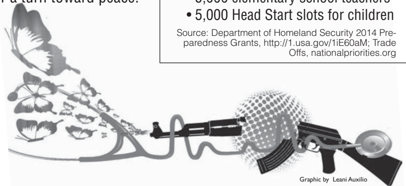
Graphic by Leani Auxilio

From bullets to bombers to ballistic missiles, from the local police to international weapons sales, U.S. tax dollars are heavily invested in military “solutions.” At the same time, the Global Peace Index cites a 7-year trend of increasing violence worldwide ; top Pentagon contractors are setting stock price records; and the most powerful nations at the United Nations are the biggest weapons dealers. Take an action below for a turn toward peace.