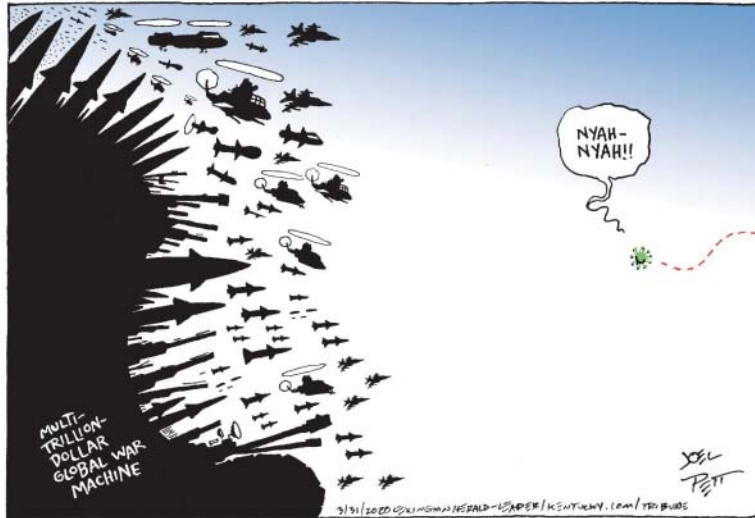
Copyrighted by Joel Pett and used with his permission

The major threats to our security — pandemics, climate crisis, domestic threats — cannot be stopped with troops and bombs. We need to rethink national security and redirect funding from the military to prevention, repair, and care.